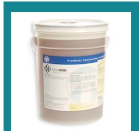
5-gallon pail SKU: MQL1000/5 UPC-12: 641238038603