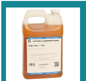
1-gallon jug SKU: MQL1000/1 UPC-12: 641238038559