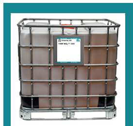
270-gallon tote SKU: MQL1000/NR270P UPC-12: 641238074779

TRIM ® MQL ™ 1000 | ©2004-2021 Master Fluid Solutions ® | 2021-12-27