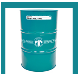
54-gallon drum SKU: MQL1000/54 UPC-12: 641238038597